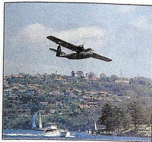
A Catalina over Rose Bay.